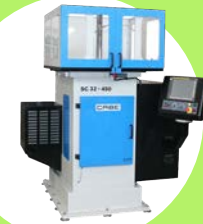
Keyseating CABE SC32-450