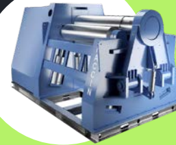
Plate Bending Faccin 4HEL-1026