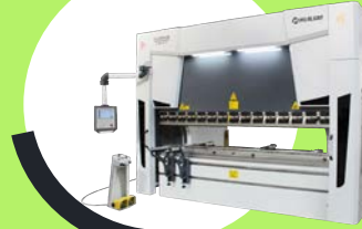
Press Brake Hilalsan CAP 3135