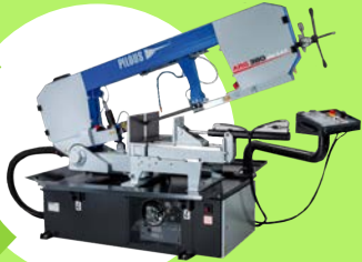
Band Saw Pilous ARG 380