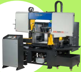
Band Saw Pilous ARG 520