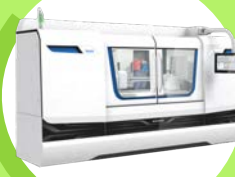
Grinding Studer Favorit