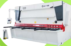
Guillotine Shear Hilalsan AGM 3010